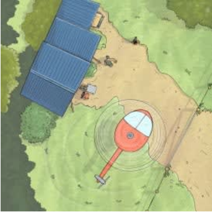
Rituko rinde ria ekoromoni, erikobuta ekagwa ase enasari.